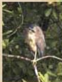
Black-crowned Night Heron