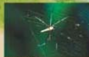
Golden Web Spider