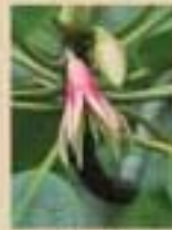
Calyx of Avicennia germinans

Experience a walk through the mangrove without getting your feet wet or muddy.